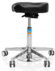
easyPro F Item No.: 2400 0010