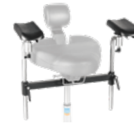
assistTrend Armrest pair incl. traverse