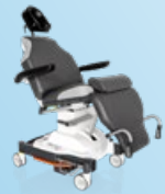
500 XLE comfort