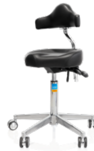
assistPro H Item No.: 2400 0009