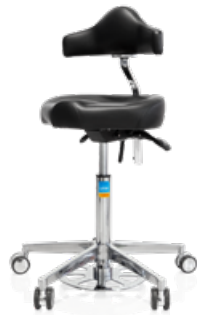
assistPro F Item No.: 2400 0005