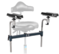
assistPro F Armrest pair incl. traverse