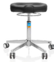
easyPro R Item No.: 2400 0013