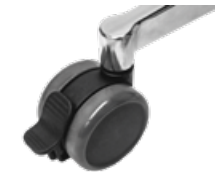
Double rimmed castor, 65 mm, with braking function