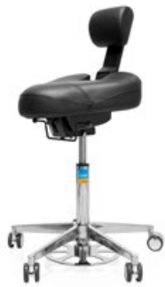
assistTrend Item No.: 2500 0002