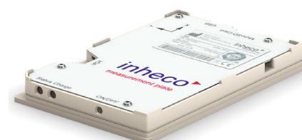
7901000: INHECO Measurement Plate, IMP

INHECO offers a compact and precise measurement plate (IMP) in ANSI/ SLAS format for verification of temperature and humidity in the SCILA device. The IMP can be used on heating, cooling, shaking devices and inside incubation chambers. We refer to the IMP brochure for more information.