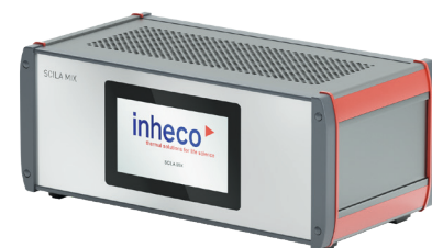
3800101 SCILA MIX 2-gas mixing device, optional