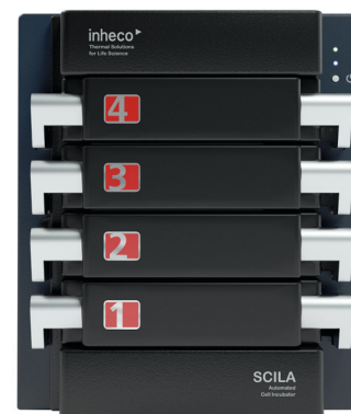
SCILA front view

The modular design of the SCILA allows to scale up with additional units when required. Fast access of less than 10 seconds and an optimized concept for temperature, humidity and gas atmosphere control enable quick recovery of the incubation conditions after plate access. For easy maintenance and service access to the incubation chamber, the complete front frame and the drawers can be removed by hand and without tools.