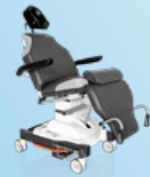
500 XLE comfort