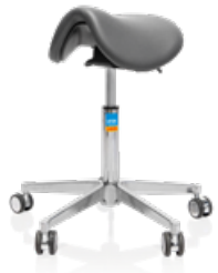
assistLine Item No.: 2400 0015