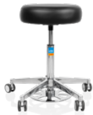
easyLine F Item No.: 2400 0020