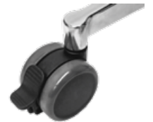
Double rimmed castor, 65 mm, with braking function