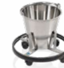
stayClean kick bucket