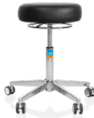
easyLine R Item No.: 2400 0022