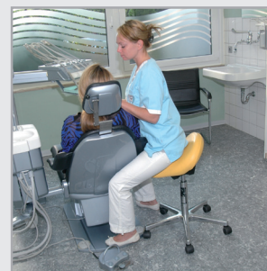
Fig. 1: The perfect posture with the Bambach Saddle Seat.

The Bambach Saddle Seat comes in various designs. With backrest or with additional armrest, or – which is my favorite – Classic, without any extras. “Cutaway”, the seat with narrow curvature, is suited for small and slender persons, like our female staff. I also like the special seat for surgery as its height can be adjusted by foot. And not to be forgotten – The Bambach before seating can be adjusted in its inclination as well. Persons of different body heights profit from the selection of various column heights. The seat is covered in breathable leather and Hager & Werken has just recently changed for the better, now using high noble leather from German car manufacturers. Your pants will never be soaked with sweat even in case of longer treatments. Additionally, the seat is available in any color matching your treatment unit. I also tested Bambach in longer