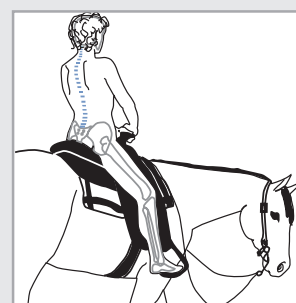
Fig. 3: The Bambach Saddle Seat is inspired by the straight posture of horseback riders.