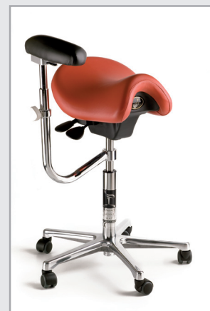
Fig. 4: The Bambach Saddle Seat (Hager & Werken) is available in different colors and versions. Therefore it fits into every treatment room.

Mary Gale, an Australian occupational therapist and inventor of the Bambach Saddle Seat, researched the sitting position on horses, the fact that people with a wheelchair are able to sit on horseback without any support and why equestrians suffering from back problems are pain free once on horseback. You can learn more about her experiences from her book and leaflet about this seat. Please request free literature and appointment for demonstration at Hager & Werken's ( www.hagerwerken.de ). Legions of dental professionals and the general public cannot move without pain due to poor posture. Choosing the Bambach Saddle Seat will solve this problem. Make the smart choice. On a Bambach Saddle Seat.