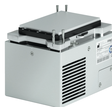
7100160: Thermoshake AC