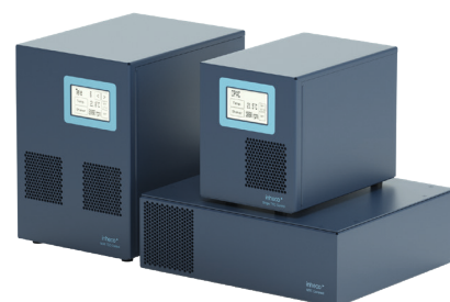
8900029: MTC Compact 8900030: Multi TEC Control (MTC) 8900031: Single TEC Control (STC)

INHECO offers a compact and precise measurement plate (IMP) in ANSI/ SLAS format for verification of temperature and/or shaking performance. The IMP can be used on heating, cooling, shaking devices and inside incubation chambers. We refer to the IMP brochure for more information.