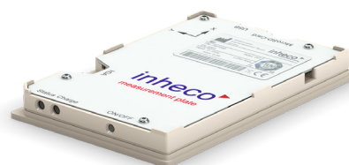
7901000: INHECO Measurement Plate