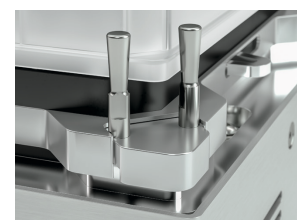
7100160: Clamping rods