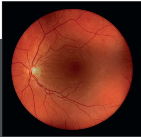
View of a retina through a cataract with visionBOOST*