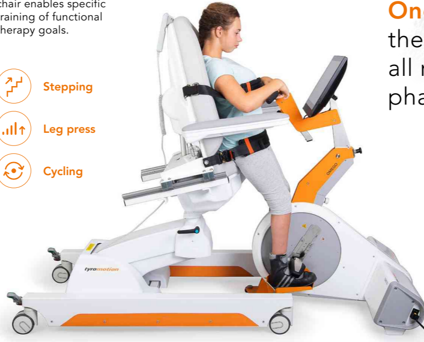
VERTICALIZATION | STEP INITIATION | WEIGHT BEARING | TRUNK CONTROL

One device for gait therapy goals across all rehabilitation phases