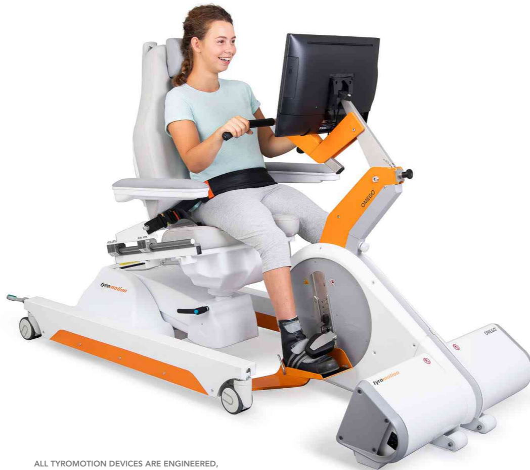
ALL TYROMOTION DEVICES ARE ENGINEERED, DESIGNED, AND MANUFACTURED IN THE EU.