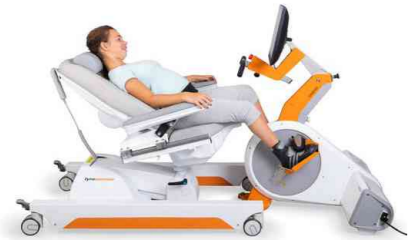
EARLY MOBILIZATION | PASSIVE & ACTIVE ROM