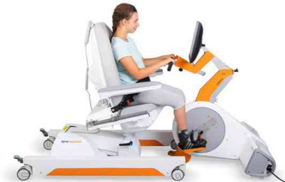
ENDURANCE | MUSCLE STRENGTH

The multifunctional chair enables specific training of functional therapy goals.