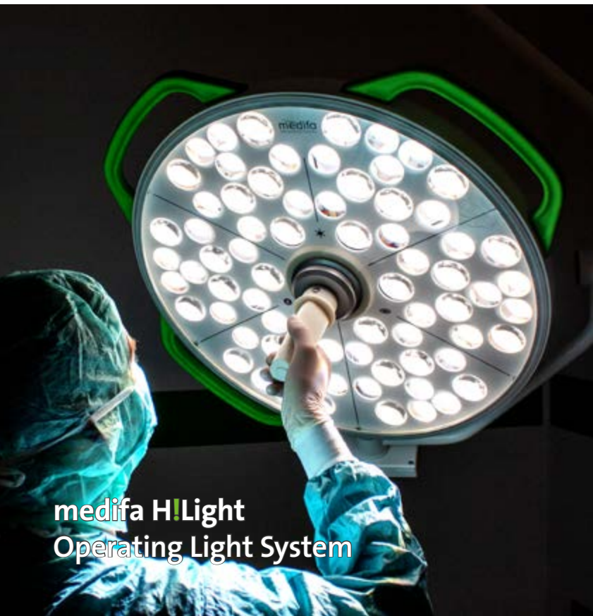
medifa H!Light Operating Light System