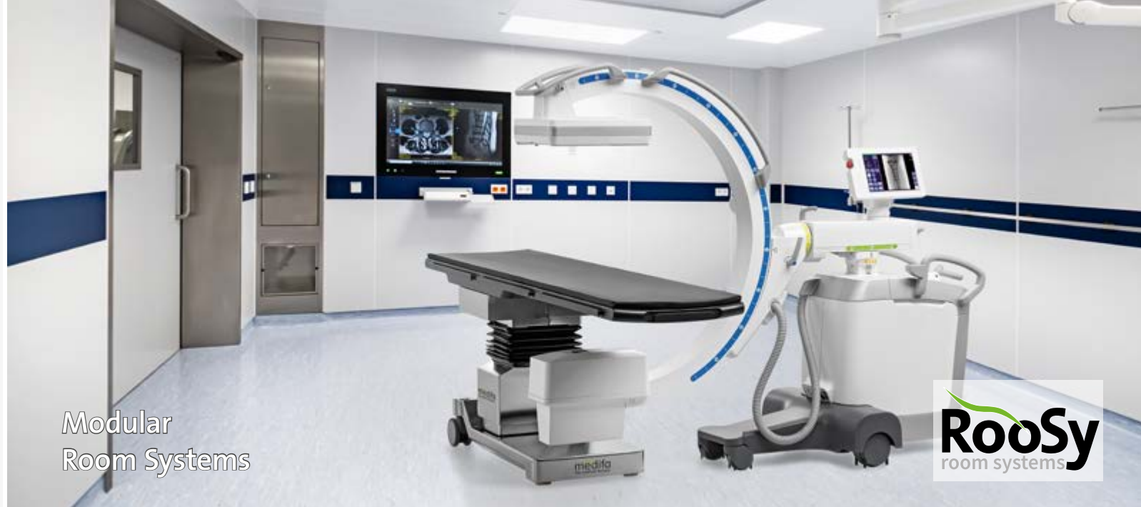
Modular Room Systems