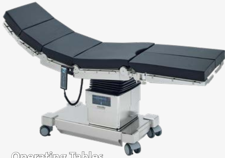
Operating Tables and Accessories