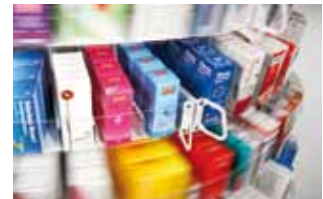
Simple operation through rotatable shelves