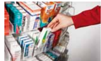
Quick removal of packages