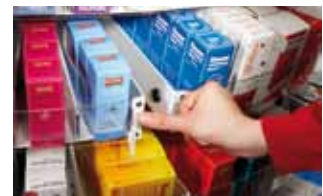
Easy refilling thanks to magnetic storage segments