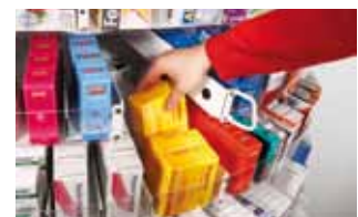
Observance of the FIFO principle thanks to filling from the back