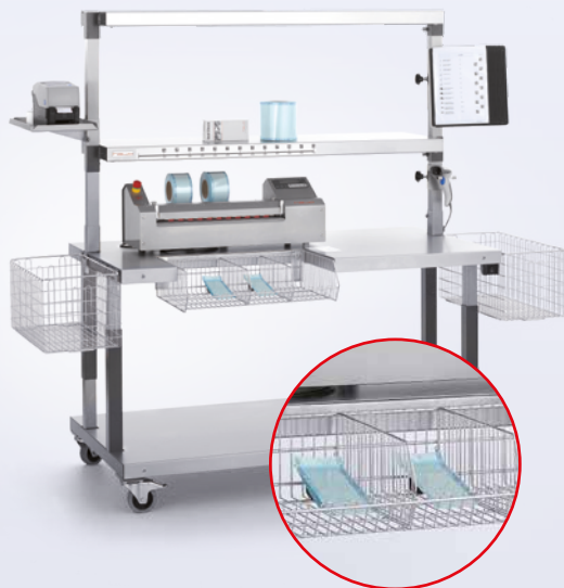
Perfect sorting with flexible compartments