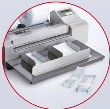
Optional sorting module hm 8000 SD (flexibly adjustable)