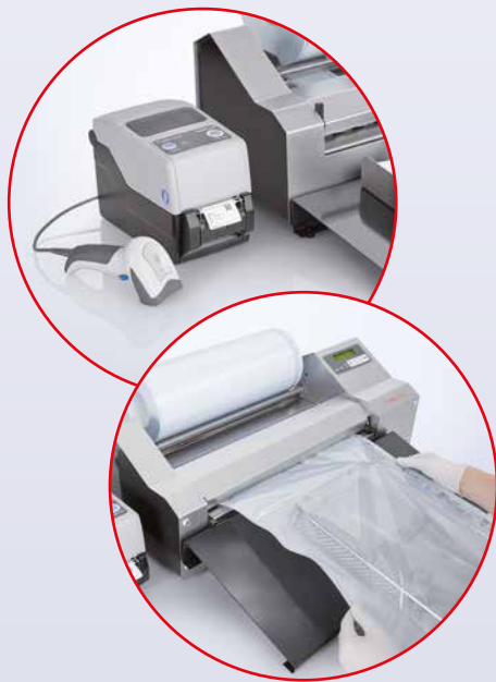
Sealing of pre-formed sterile barrier systems